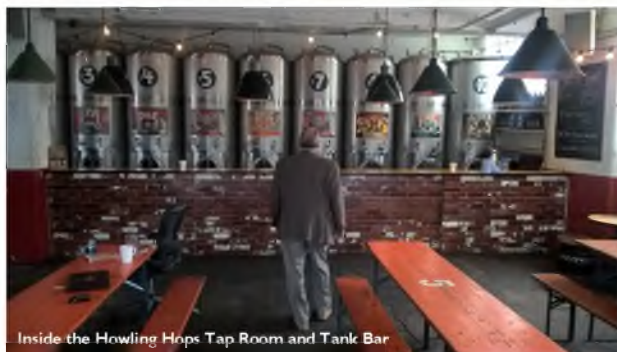
Inside the Howling Hops Tap Room and Tank Bar

The Howling Hops Tap Room and Tank Bar , to give it its full title, is based in an old glass factory – curious slots and marks in the stone floor bear testament to its industrial past and in keeping with this image is the unmistakable sight of a rank of conditioning tanks standing sentry across the bar. The Brewery is behind this and indeed you have to walk past it to get to the loo!