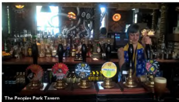
The Peoples Park Tavern

On the day of our visit the tanks contained IPA, Like, Molecular Later, Pale Ale, Pale XX, Chocolate Stout and Imperial Stout aka 'Fighting Ale'. Beer is dispensed direct from the tanks through taps into either 1/2 pint jugs or 2/3 pint glasses. I decided to sample the 'Fighting Ale' which was only available in 2/3 pint measures at £2.90.... but then again it is 11.5%! So I had two! Pete and Alan were more sensible. The drinking area is set out