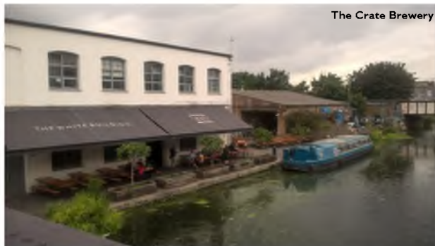
The Crate Brewery

The Crate Brewery A Riverside brew pub serving their own ales from six hand pumps and key taps in an almost traditional pub setting with an outdoor drinking area on the river bank. On offer were Crate IPA, The Red, Nitro, a session IPA, Hefeweizen Wheat Beer and Sea Cider. The keg taps offered Belgian style pale and fruit sour beers. Greek style food is served and the Brewery can be seen behind a glass screen. Alan noticed through the back window of the bar, the Howling Hops bar. Time to crack on!