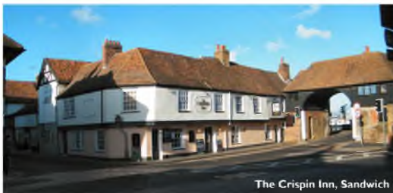
The Crispin Inn, Sandwich

The fifth day of our Trail and one confined entirely to Sandwich, starting at midday with a visit to the King's Arms in Strand Street. Away from the town centre, on the road that leads out west towards the bypass and Ash, approach to the pub is often from the rear, entering, as on this occasion, through the car park. Beer choice was Harveys Sussex Best and Greene King IPA. Next stop was also in Strand Street, the Crispin , at the other end on the corner with the High Street near the ancient barbican and (former toll) bridge across the Stour. Crispin Ale in excellent condition, Madcap Greenhop and Adnams Broadside were on the handpumps.