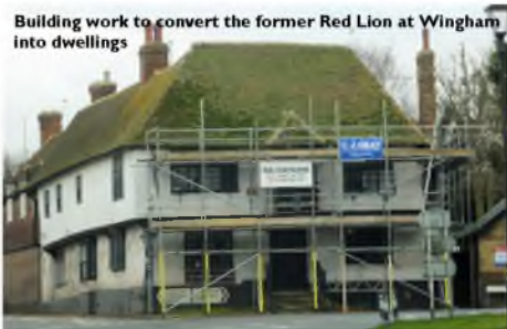
Building work to convert the former Red Lion at Wingham into dwellings

the Dog recently designated one of the three best in Kent by Kent Tourism, and the Anchor , offering its wide choice of events and music. There is also a welcoming open fire in the bar, and just after New Year a choice of Abbot, Harveys, Doom Bar and Adnams Ghost Ship.