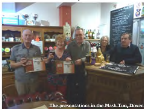
The presentations in the Mash Tun, Dover