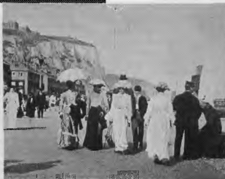
Promenading on the Seafront, 1906