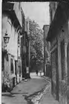
St. James's Lane leading on to the old Townwall Street