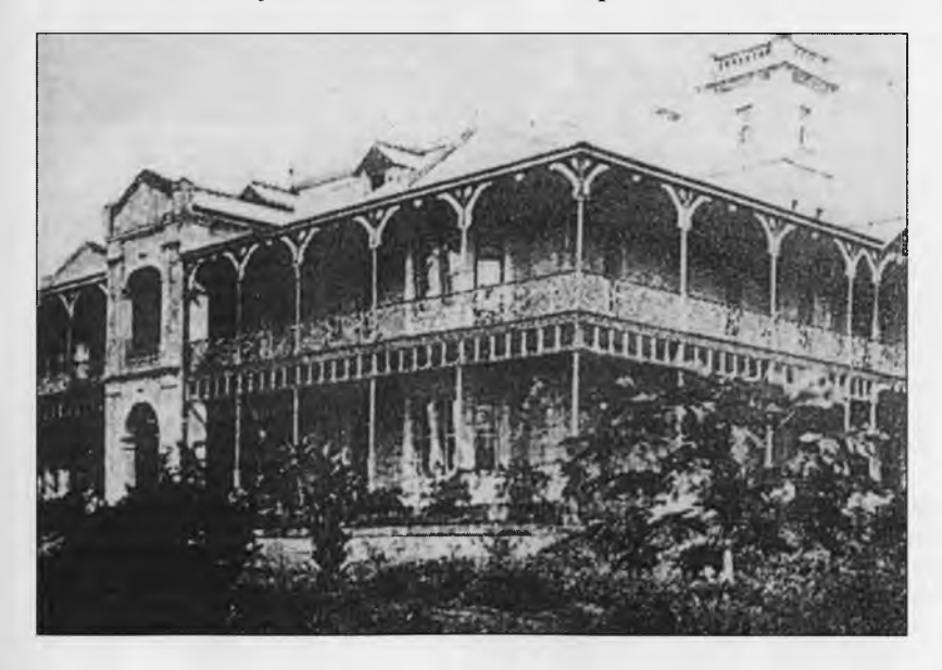
Kearsney House, later Kearsney College. Note the sleeping balcony.

The activities of the first few years remain rather vague, enshrouded in the memories of the handful of boys who were educated there. Even the school timetable was vague, and it is stated that in the early days the staff used to meet at the end of each lesson and decide what they would teach next! It was very much a family existence. Motor cars were few and far between, and the main contact with Stanger was via an eighteen-inch gauge railway line, installed in 1901 for the transport of tea. Boys returning to school would catch the train from Durban to Stanger, then squash themselves into the tiny