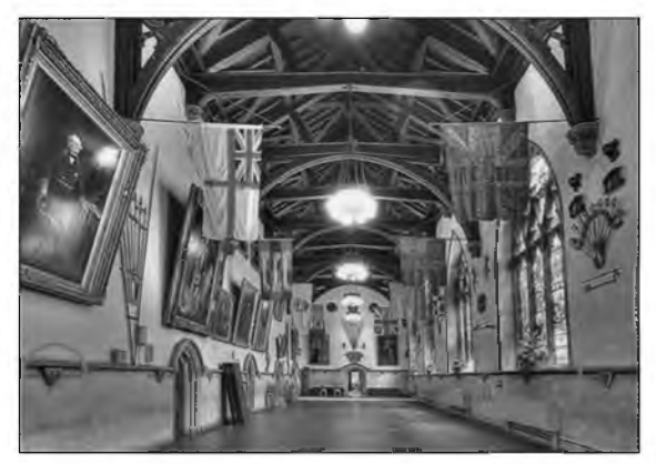
Dover Maison Dieu Connaught Hall

Burges' most important final work was again in Dover. The town council