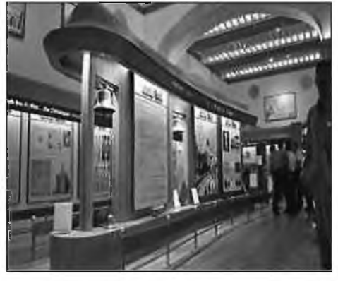
A Vision of the Future - Heritage Centre at Fort Burgoyne

Chris told us that Fort Burgoyne was the result of a Royal Commission led by Lord Palmerston in 1859, with the main fort being completed in 1867. 'Castle Hill Fort' as it was known in 1872 became 'Fort Burgoyne' on Queen Victoria's instructions. Connaught Barracks was built in 1913 and an aerodrome was constructed at Guston in 1914. We were shown slides of the area by Chris that illustrated clearly the strategic significance of Fort Burgoyne and the