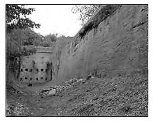
Moat at Fort Burgoyne