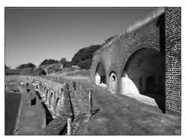
Casements Fort Burgoyne

The Trust has already set about routine maintenance. with contracts in place to remove vegetation and to manage other issues. These include an unstable ditch wall and a rusting bridge which needs attention. А partnership with Lee Evans over three years costing £1.6million will lead to stabilisation through routine maintenance.