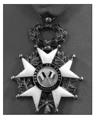
French Legion of Honour