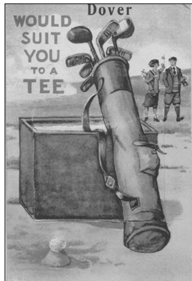
Poster, Dover Golf Club