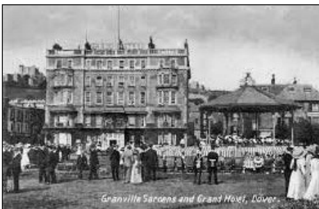
Grand Hotel Dover, Postcard