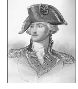
Engraving of John Burgoyne