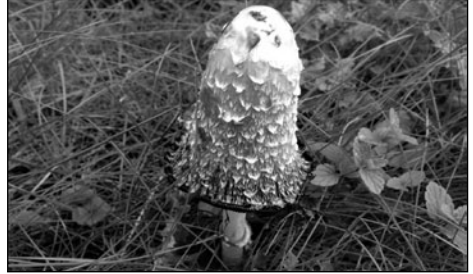
Shaggy Ink Cap Mushroom

And what species remains more than 90% undocumented?