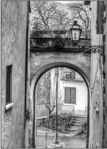
L'antica Porta San Angelo

We used to see films at a small local cinema in Italy, very like the delightful