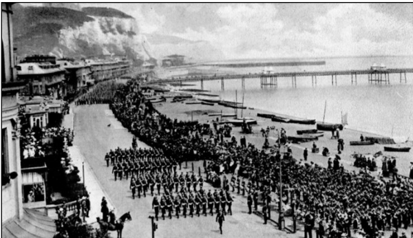
March Past of Royal Artillery, King's Birthday Parade, Dover Seafront