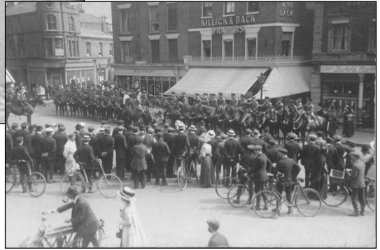
Dover's only cavalry unit: Dover Troop, (Duke of Connaught's Own) Royal East Kent Mounted Rifles, on parade in the Market Square, probably around 1907.