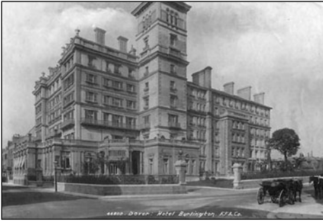
Burlington Hotel, Dover 1898

However, following her death in 1842, her beautiful Clarence House was sold to the Clarence Hotel Company. The company took years to build the hotel and they found that they had over-stretched themselves financially and eventually had to lease the hotel to the Imperial Hotel Company which opened the Imperial Hotel in 1867. Its fortunes were chequered closing in 1871 and it later it changed hands to become the