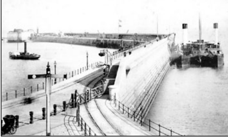
Early Ferry at Admiralty Pier

Cricket was played on the meadows where Beaconsfield Road was built. Football does not get a mention, but skating was popular in hard winters, using Priory Ponds, at Effingham, as well as Maison Dieu Fields, which were deliberately flooded for the purpose.