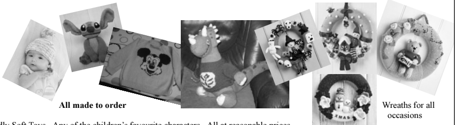
All made to order

Something Different - Unique and Unusual Framed Hand-Crafted Diamond Pictures by Denise